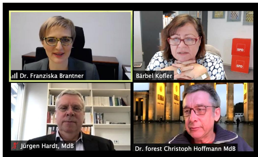
Image: Three Members of the Government Coalition: Dr. Franziska Brantner of Bündnis 90/die Grünen, Dr. Bärbel Kofler, SPD, Dr. Christoph Hoffmann FDP and Jürgen Hardt of the opposition CDU engaged in a lively Discussion "Nach der Wahl: Das Programm des 20. Bundestages"