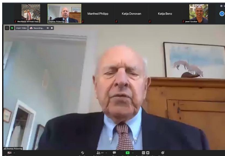
Image: Ambassador Pickering addressing his large audience