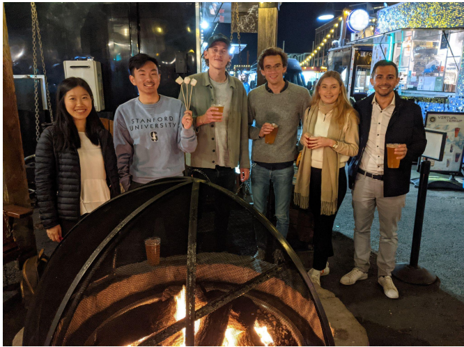
Image: Welcome of the Current DAAD Fellows in the DAAD-AA West Coast Hub.