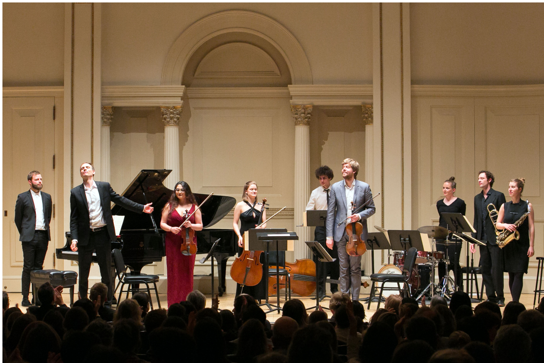
Sound Understanding Concert, Orchestra.

The annual DAAD Sound Understanding Concert took place on April 16 in the Weill Recital Hall at